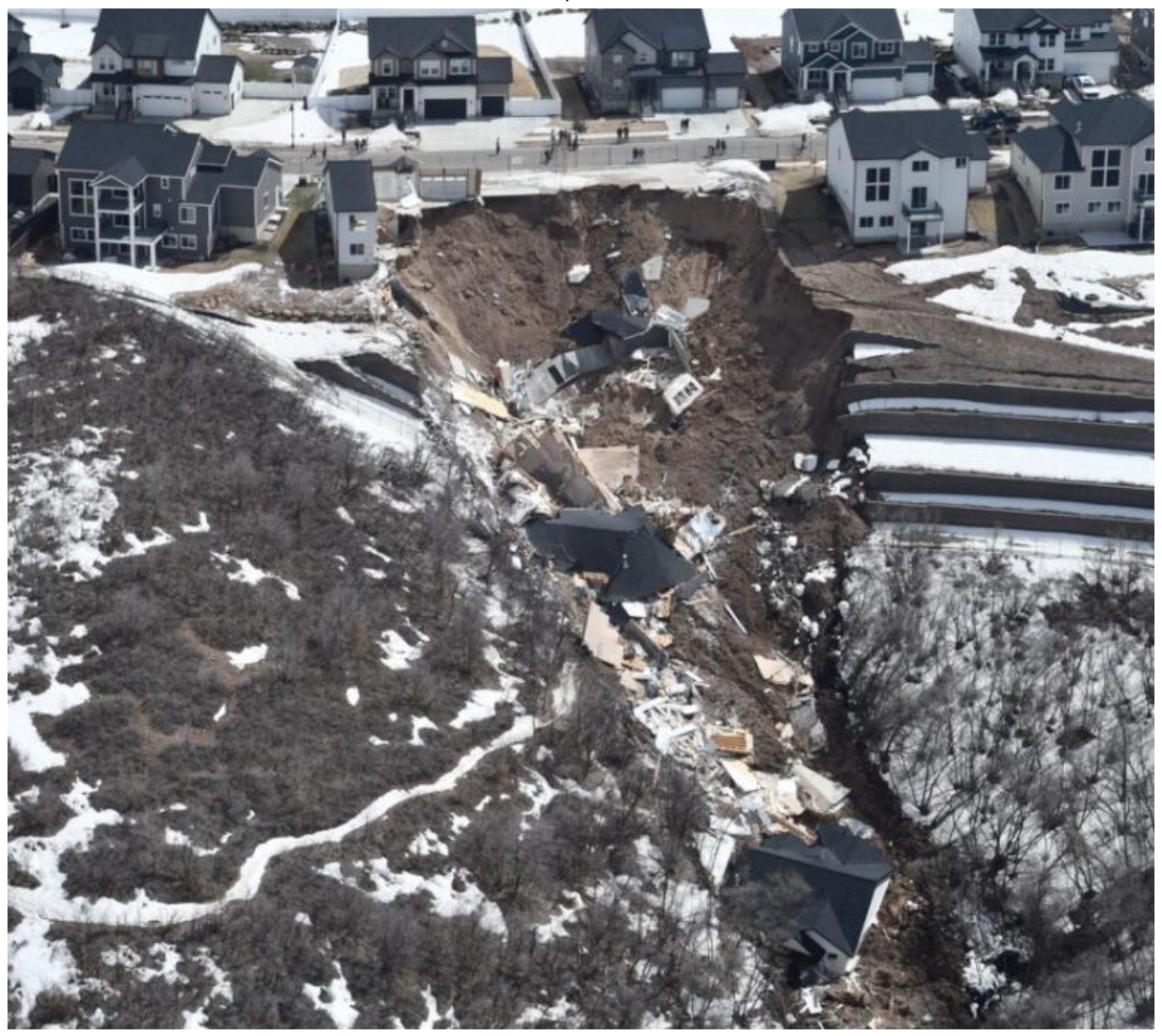
2023 Springtime Road Landslide, Draper, Utah. Photo: Ben Erickson